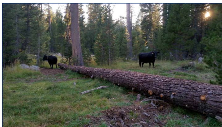
"With bells on..."

http://www.facebook.com/russianriverflyfishers