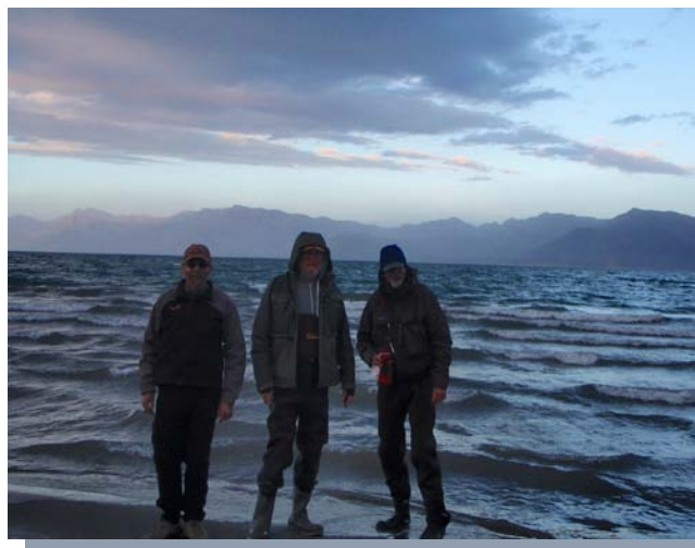
Pyramid can really blow . . .

Be prepared for windy, cold weather fishing, especially if the bite is still best at dawn and dusk. Also, watch for wind coming from the North.