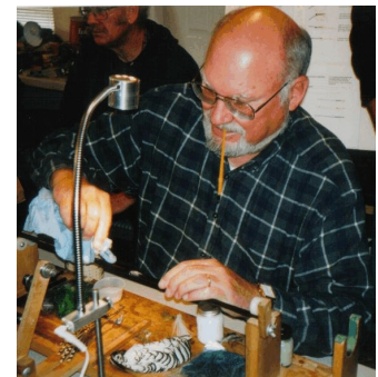
Rafael Show February 27 - 29.

As scheduled, day 1 of the advanced rod building class took place on February 21. The second was scheduled 2 weeks later, March 6, because Charlie Schillinski's talents as a Master Fly Tier were requested at the San